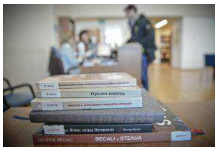
In this photo taken on Thursday, Jan. 14, 2016, books written by inmates and published while serving ...

written by an unidentified prisoner in under seven hours, as well as a 180-page book written in 12 hours.